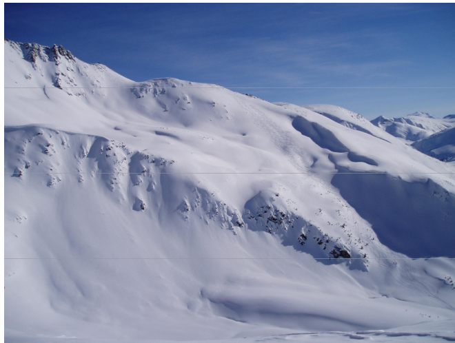
What is the best route through this complex terrain that suits the comfort level for risk in your group? Is there one?

Based on your assessment, you can make terrain choices that adjust the risk to a comfortable level for you and your group. Managing risk is all about your position in the terrain. When the complexity of the snowpack threatens to overwhelm you, use your skills to find simpler terrain where you feel comfortable again. This comfort level is a personal choice and is different for everybody – some are willing